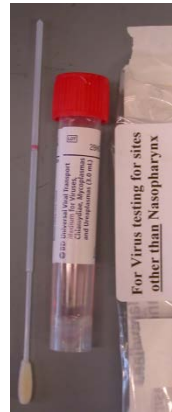
Universal Transport Medium